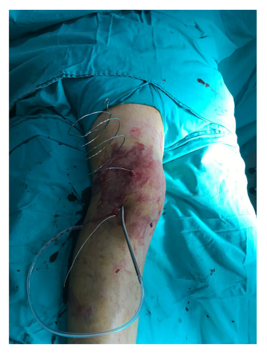
Figure 3. After the pattela is passed from its medial and inferior edge, the cerclage is moved back to the superolateral corner

cerclage was tightened to compress the patella and knot in the superolateral corner (Figure 5). Next, the reduction was checked fluoroscopically (Figure 6a, b). The skin was closed primarily (Figure 7). A demonstration of the pericerclage method with the closed technique is shown (Figure 8).