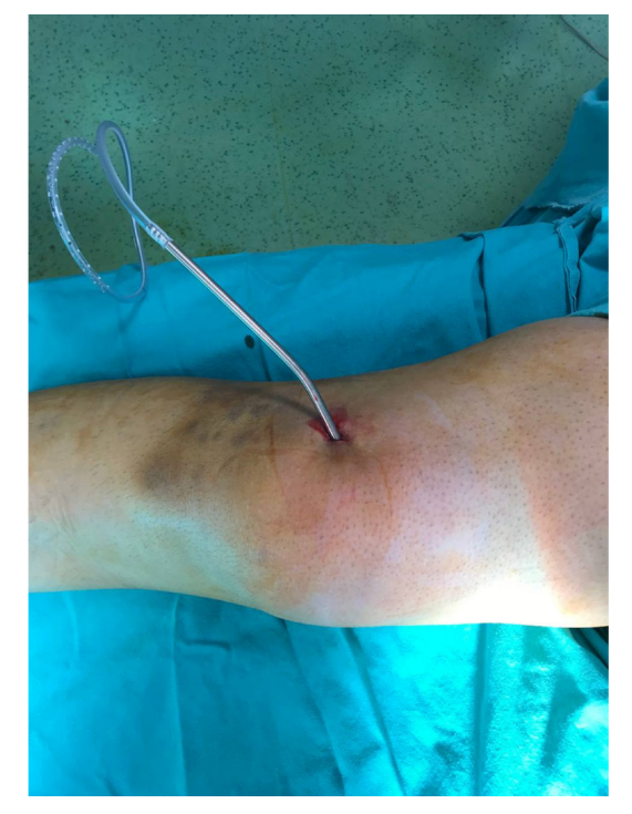
Figure 1. Application of a cerclage-loaded drain trocar with a mini-incision from the superolateral corner of the patella

After spinal anesthesia, patients were prepared supine on the radiolucent table. Thirty minutes before the incision, 2-q cephalosporin was administered to all patients. Tourniquet was not applied. After sterile dressing, the hematoma was aspirated from the suprapatellar region using a 50 cc injector. Then closed reduction was applied by extending the knee and using a weber clamp. First, an incision of about 1 cm was made from the superolateral corner of the patella. Next, the drainage trocar was inserted from the superolateral corner (Figure 1). To the superomedial corner inside the quadriceps tendon toward the superior border of the patella with a cerclage wire inserted into the tube (Figure 2) and exited from the superomedial corner. Then the trocar re-entered the superomedial exit point, advanced along the patella's medial border, and removed from the inferomedial corner. Next, the trocar was advanced along the inferior border of the patella through the patellar tendon by the same approach and removed from the inferolateral corner of the patella. Then the same procedure was performed along the lateral edge of the patella (Figure 3), and the trocar was removed from the superolateral corner, the first entry site with the cerclage wire inside the tube (Figure 4). Next, the