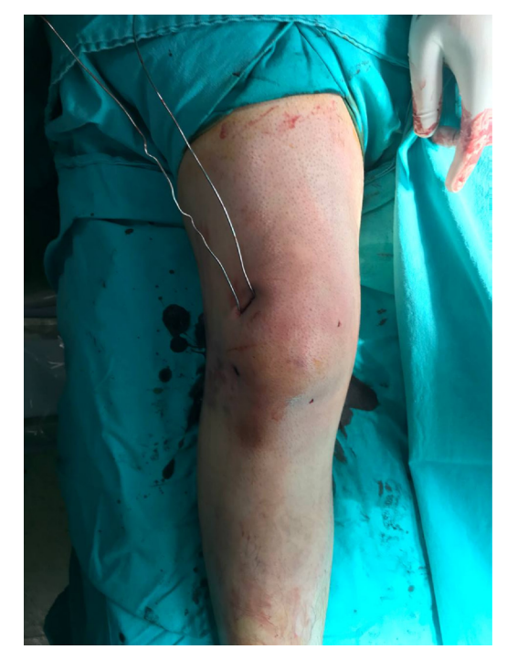
Figure 4. Moving the cerclage from the superolateral corner to the starting point

Statistical analysis was performed using the IBM SPSS version 23.0 software (IBM Corp., Armonk, NY, USA). Descriptive data are expressed as mean and median (minimum-maximum) for continuous variables and in number and frequency for categorical variables.