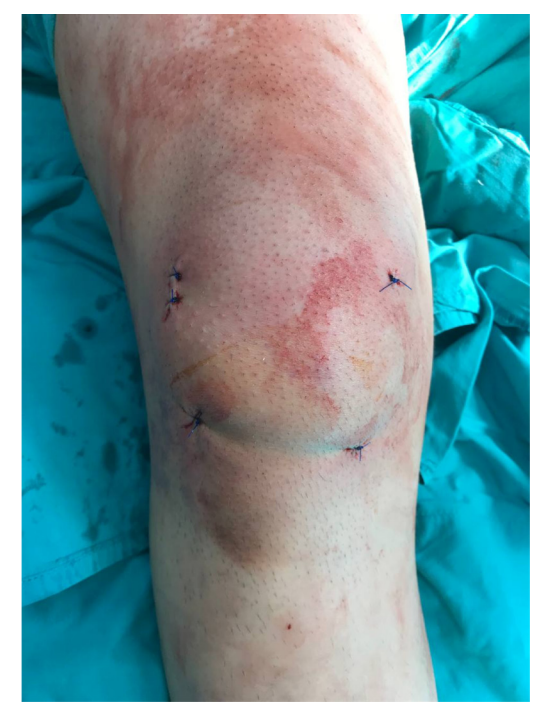
Figure 7. Primary closure of incisions

The mean operative time was 50 (35-90) minutes. The mean follow-up time was 16 (12-27) months. None of the patients experienced early soft tissue problems or infections. No loss of reduction or implant failure was observed. Union was achieved for all patients. In 2 patients, the implant was removed due to the development of implant irritation. In these two patients, no complications occurred after implant removal.