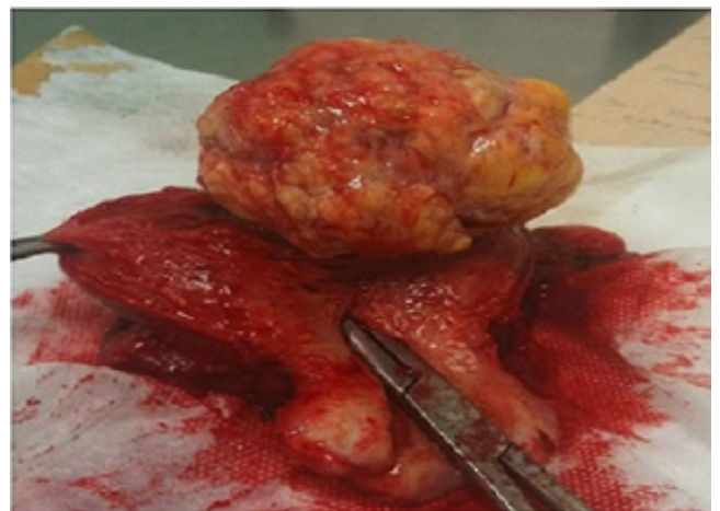
Figure 2: The fibroid-like mass approximately 6x6 cm in diameter that excised from the posterior wall of the uterus

The patient underwent total abdominal hysterectomy and bilateral salpingo-oophorectomy on January 30, 2013 with an initial diagnosis of uterine mass. Intramural fibroid like mass with an approximately 6x6 cm in diameter arising from the posterior wall of the uterus was visualized intraoperatively. Considerable enlargement of the uterine size was seen in the operation. Bilateral ovaries and salpinx were detected as normal (Figure 2). Uterus together with the lesion, tuba uterine and ovaries were excised. All tissues obtained from the operation were sent for the pathological evaluation. The cut surfaces of the tumor revealed a marked gray, pink and brown discoloration suggesting mottling appearance. Necrosis and hemorrhage were barely seen in the lesion. Hematoxylin-eosin-stained sections of the lesion revealed the adipose tissue and blood vessels between the muscle bundles. The pathological examination has resulted in ALLM diagnose (Figure 3). The patient continued routine follow up visits after the operation.