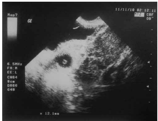
Figure 2: Ectopic focus with gestational sac and yolk sac and organised coagulum at the left adnexa .